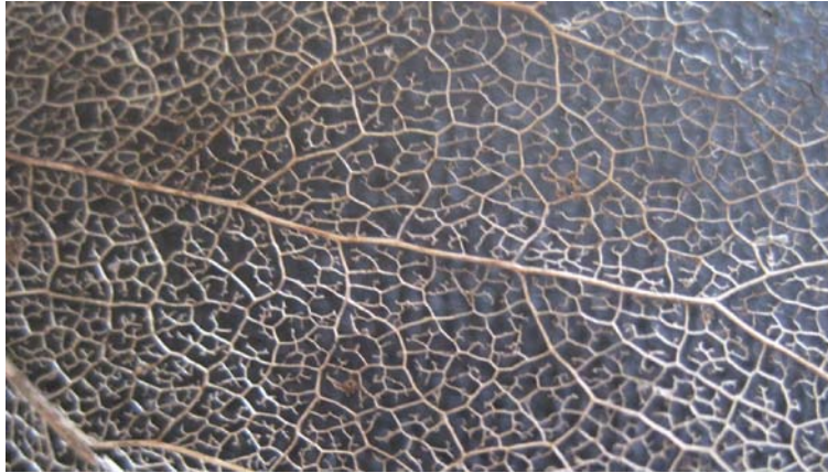
Figure 4: Interconnectedness

Engagement with living soil in school learning gardens is one practical way to introduce students to the idea of interconnectedness.