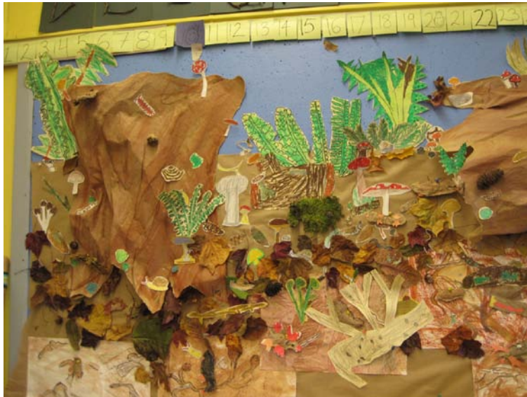
Figure 2: Student mural of soil life

Soil is more than a mere growing medium. It is a unique confluence that includes eroding rock, decomposing biomass, microorganisms, animals, insects, water, and air. It is layered, develops over time, is fragile yet resilient, and contains and supports life.